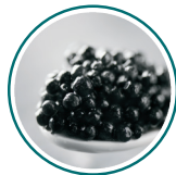
REPAIR Caviar extract