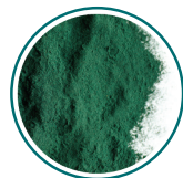
HYDRATION Spirulina / Hydra Complex

A comprehensive line of products designed to take your moisturizing routine a step further, regenerate your skin and restore its natural elasticity.