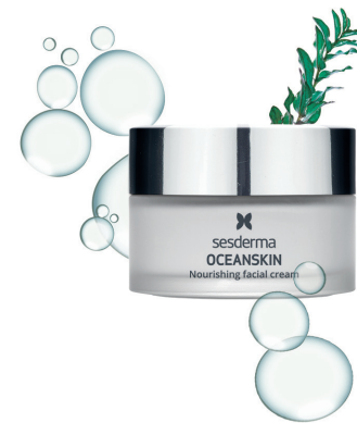
OCEANSKIN Nourishing facial cream [ 50 ml ]

Apply on your face twice a day by massaging gently with your fingertips, until complete absorption.